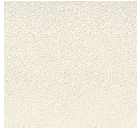
USG Boral Ensemble™ Spray-Applied Finish